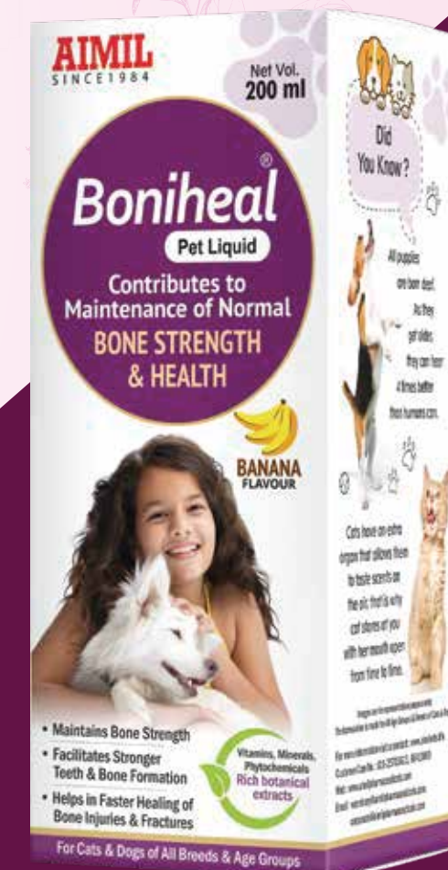
Pack of 200 ml